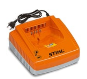
Battery Charger - AL 300 - Quick

Quick charger for STIHL Lithium-ion batteries. With operating mode indicator and integral air cooling. The AL 300 quick charger takes 75 minutes for 100% charge of AP 300 battery. Rated voltage: 240 V.